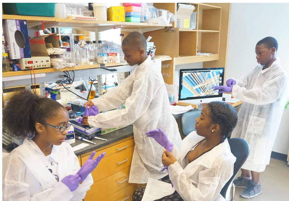
TCP students participating in a lab exercise at Harvard Medical School